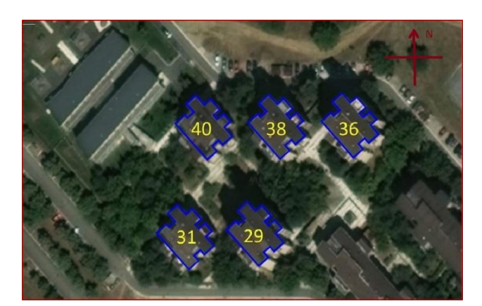
Figure 2. Aerial image of the residential buildings